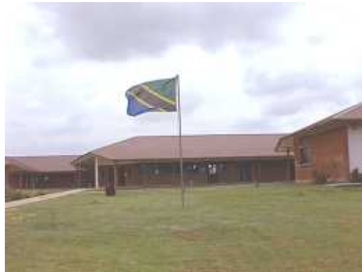
The ISM – Arusha Campus, 1996

Every year, ISM added one extra class and by the mid-seventies, ISM was offering the International Baccalaureate Diploma Program, the first in Africa. As the years went by and enrollment grew at a rapid pace, the Arusha Campus was established in 1987 housed in a rented residential house. It was in 1996 that the school moved to its present permanent location 12km out of Arusha.