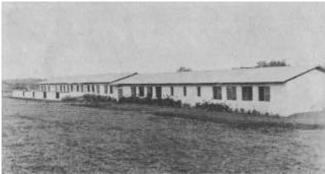
The school in 1970

Over 37 years ago when KCMC was being built, its Management, the Good Samaritan Foundation realised that a school would be required to house the children of the Doctors who would eventually work at the new hospital. Thus The International School Moshi was established on the 12 th of October 1969 with classes from Grades 1- 6. 60 students were the first to be enrolled at the new school that was housed in the nursing halls of KCMC as the construction of the school buildings were not yet complete. Most of these students were transferred from the closure of Kibo Primary School. The present Moshi Campus opened in 1970 and ISM started offering boarding facilities too.